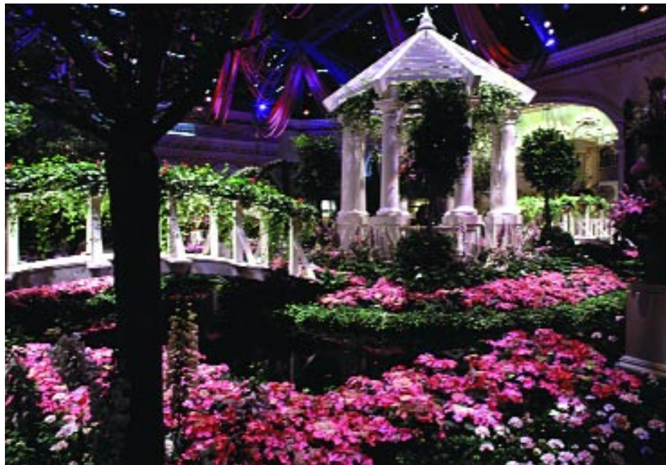
■ Above Dense and brightly colored florals cascade down from the gazebo and frame the garden bridge in the Conservatory.

Bellagio guests will be overwhelmed by the beauty and abundance of the Conservatory's color, fragrance, volume, and texture as they promenade beneath lush canopies featuring layers of romantic miniature yellow roses atop variegated yellow and green Algerian ivy.