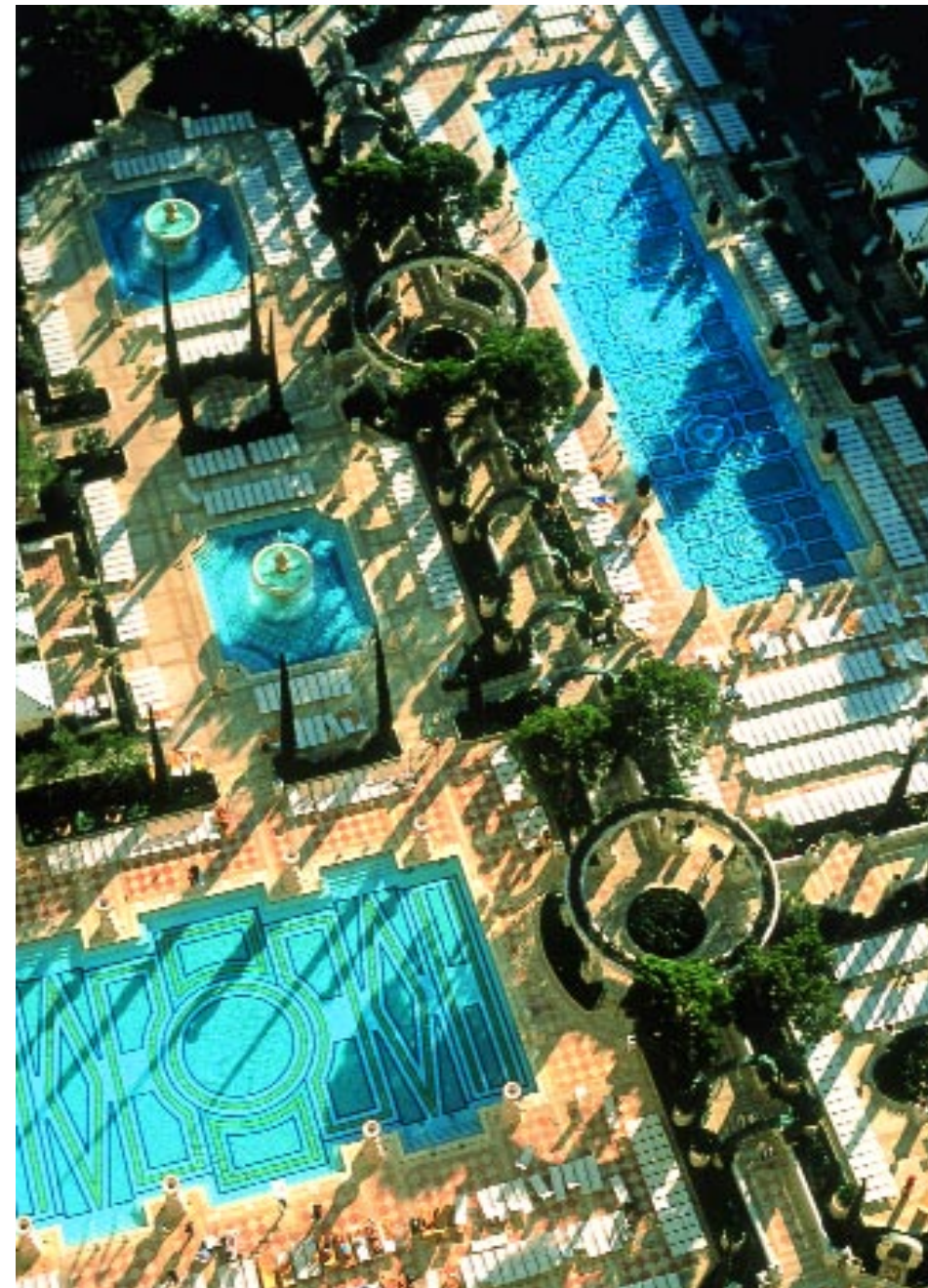
■ Above Hardscape and softscape are joined seamlessly in Bellagio's unusual pool area. Custom designed fountains and intricate designs compliment the roses which are abundant throughout.

The pool courtyards maximize guest comfort as well as delight visually and enchant aromatically. Balkan series geraniums are generously planted throughout in a riot of pinks, reds, and oranges; and are complemented by pink roses and subtle lavender. Twelve sculpted arches separate the distinct pool areas. Each arch is accented by hand-carved, three-dimensional artpieces. With