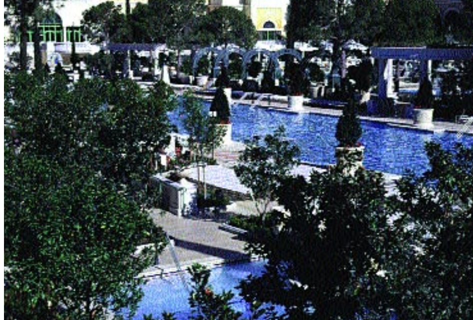
■ Above Top An airy and light-filled atrium serve as the backdrop for the lobby registration/reception area. Color palettes and accessories change out regularly to compliment the Conservatory Garden. Above Bottom The Bellagio's spectacular pool area is really an interconnected village of pools accented by trellises, planted rose arches, and private cabanas. Opposite Page An aerial view of the dramatic drive along the lake headed for the porte cochere.

Bellagio, thereby dispensing with the hectic and harried world outside," says Donald Brinkerhoff, CEO/Founder of Lifescapes International. "The first impression usually sets the tone for the experience, so in this way, the landscape design, both the softscape and hardscape, is an essential part of creating and establishing a luxury environment."